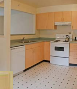
Cluster unit, kitchen and bedroom